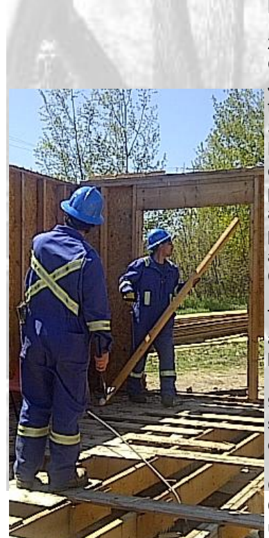
Construction Worker Preparation Program students in action Pinehouse Lake, June 2012